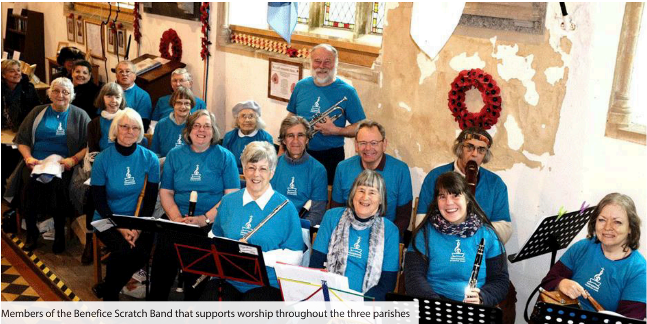
Members of the Benefice Scratch Band that supports worship throughout the three parishes

The band welcomes anyone who can, or would like to try to sing, or play any kind of instrument, and has members from all around the Benefice and beyond.