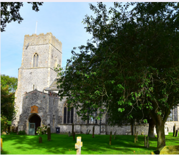
All Saints' Catfield

in the Deanery of St Benet at Waxham with Tunstead