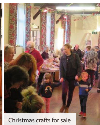
Christmas crafts for sale

The parish lies between Barton Broad and Hickling Broad and it contains a main village and three hamlets. The land is mainly used for arable and livestock farming plus extensive fens which are nature reserves within the Broads National Park.