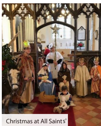
Christmas at All Saints'