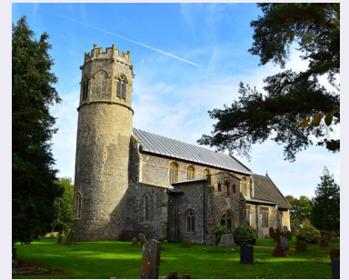
St Nicholas' Potter Heigham