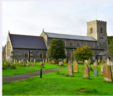
St Catherine's Ludham