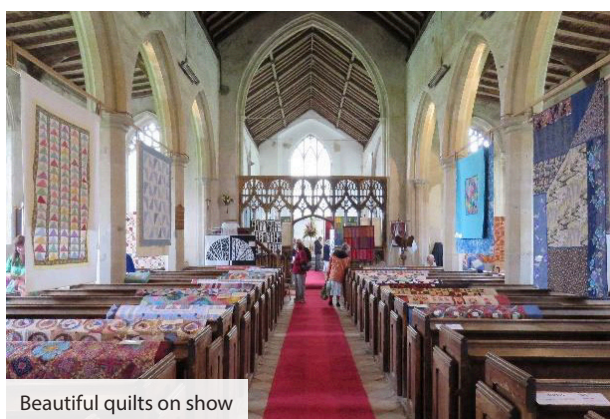
Beautiful quilts on show