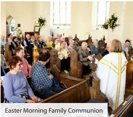
Easter Morning Family Communion