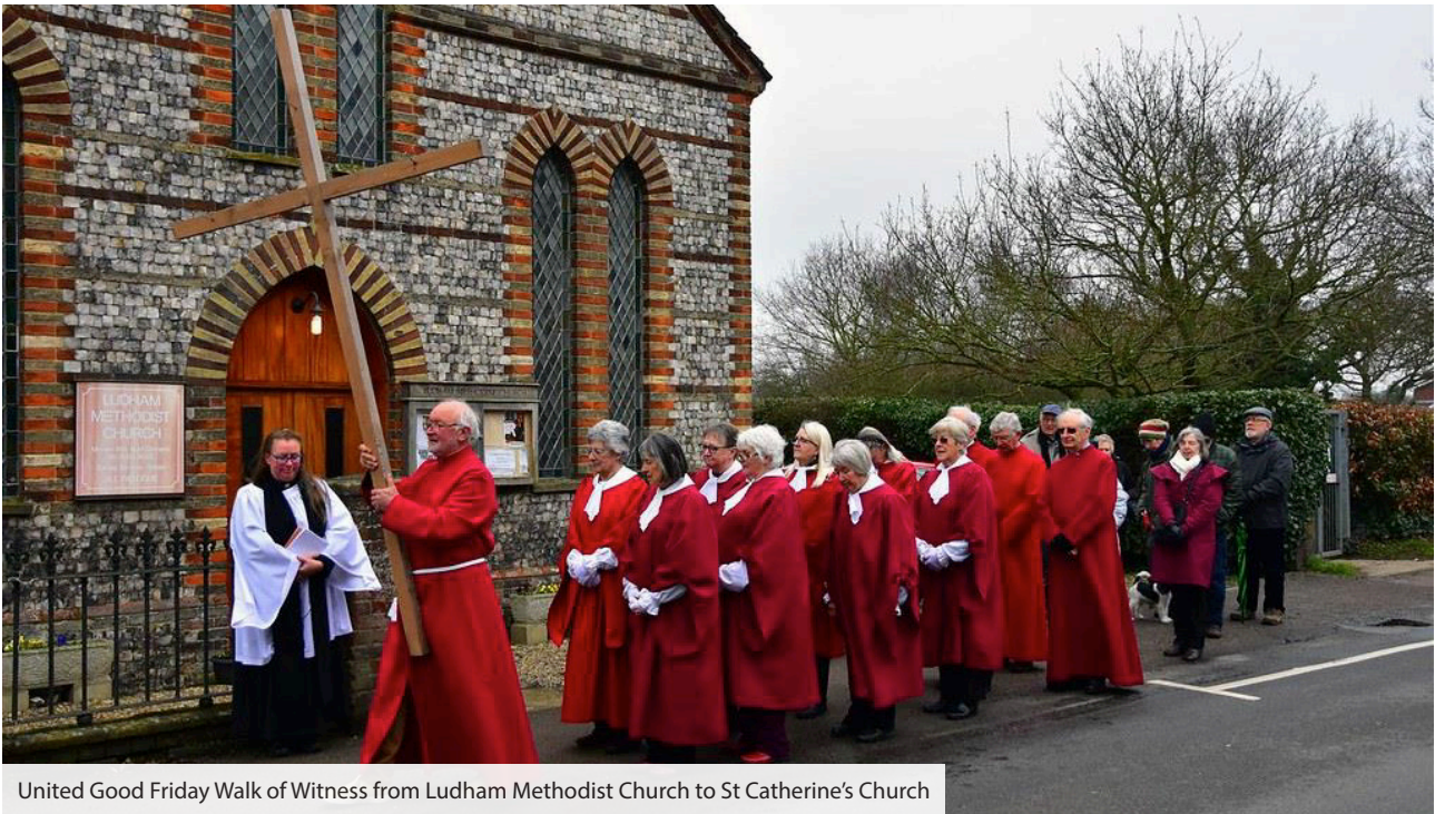
United Good Friday Walk of Witness from Ludham Methodist Church to St Catherine's Church