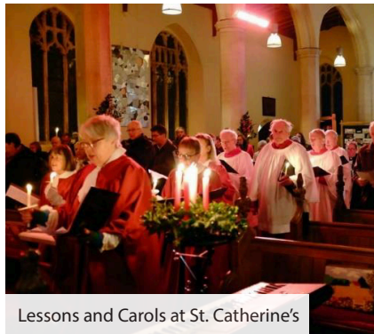
Lessons and Carols at St. Catherine's